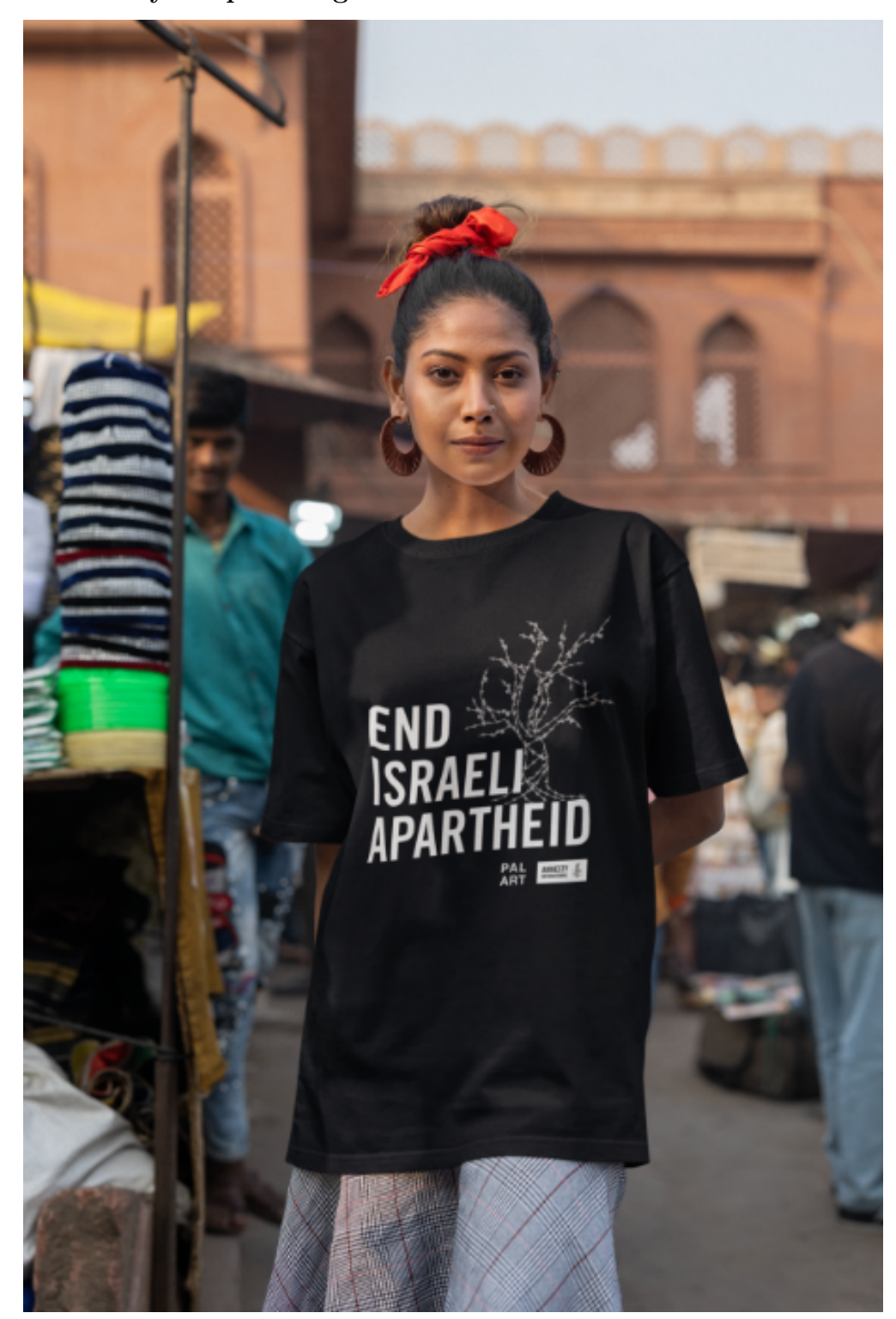
New Amnesty Shop catalogue out now!