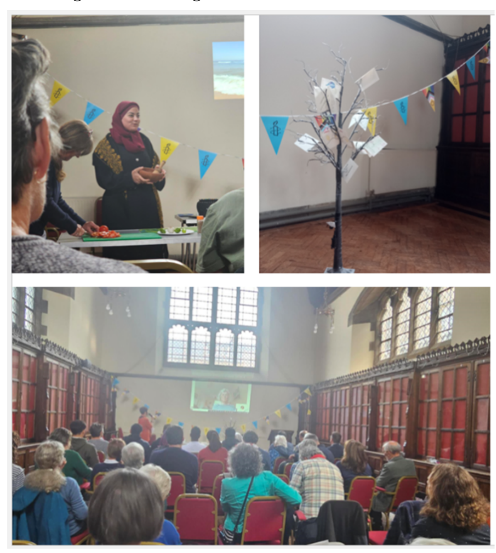
On 7 June, Scottish activists, honoured guest speakers, and AIUK Scotland and UK Staff members assembled for the Scottish Gathering.

Six members from the Glasgow West and Glasgow Daytime AI Groups attended the recent Scotland Gathering in Perth, joining around 40 activists from across seven Scottish Groups.