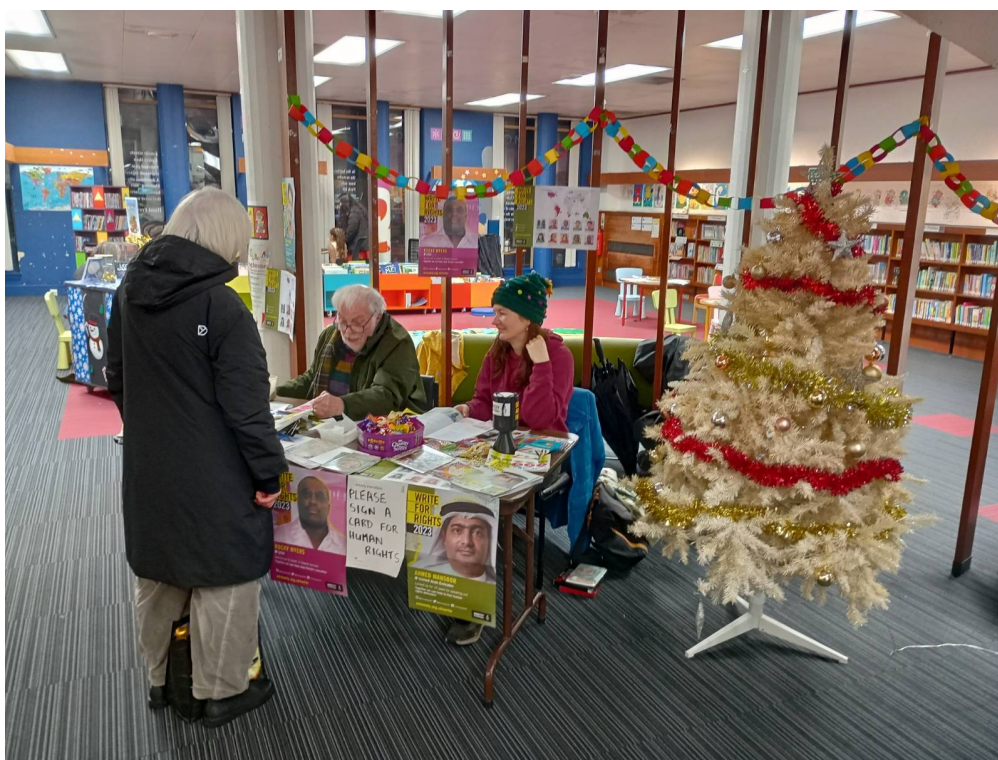
Photo: Activists from the Glasgow AI Groups with a member of the public at our Dec 2023 Write for Rights event

Amnesty International's Write for Rights campaign transforms the lives of people whose rights have been wronged.